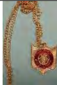
AUX-8000 MOCA Pendant $5.00