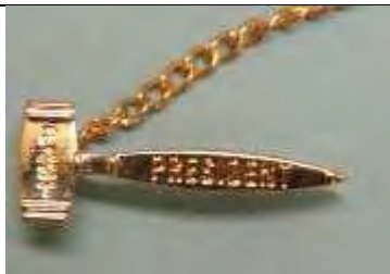
AUX-7006 Past President's Gavel Guard w/Chain $15.00