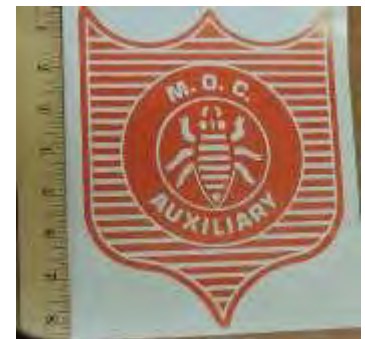
AUX-4010 Plastic Decal, Large (Exterior Use) $8.00