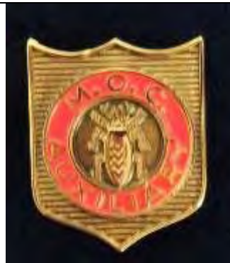
AUX-7000 Membership Pin $6.00