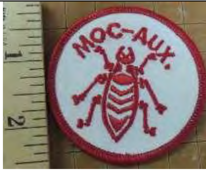
AUX-3005 MOC-AUX Patch (Round) $5.00