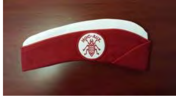
AUX-5004F "Female" AUX-5004M "Male" Supreme District Hat $75.00 (Questions on Officer hats please contact Supreme Headquarters 412-824-2240. )