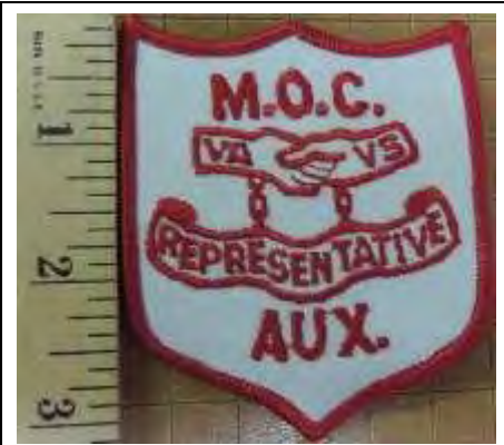
AUX-3015 VAVS Representative Patch $5.00