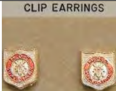
AUX-8010 MOCA Earrings - Clip On $5.00