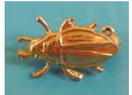
AUX-7050 Fun Bug Pin $5.00