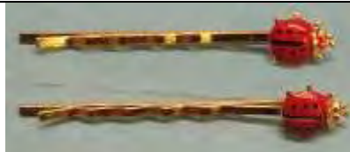
AUX-7055 Lady Bug Hair Pins (Set of 2) $1.00