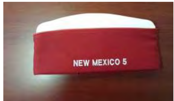
AUX-5001F "Female" AUX-5001M "Male" Basic Member Hat $50.00 (Questions please contact Supreme Headquarters 412-824-2240 .)