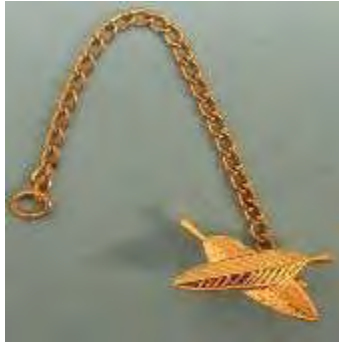
AUX-7036 Secretary's Quill Guard w/Chain $6.00