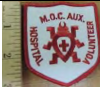
AUX-3010 Hospital Patch $5.00