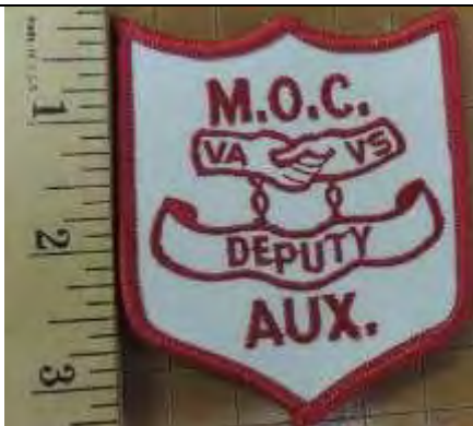
AUX-3016 VAVS Deputy Patch $5.00