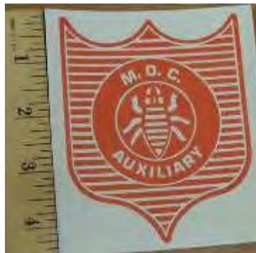
AUX-4005 Plastic Decal, Small (Exterior Use) $5.00