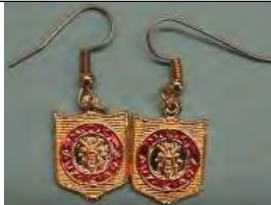
AUX-8015 MOCA Earrings - French Hook $5.00