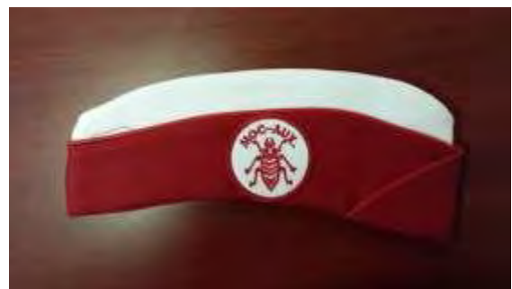
AUX-5002F "Female" AUX-5002M "Male" Auxiliary President Hat $65.00 (Questions on Officer hats please contact Supreme Headquarters 412-824-2240 .)