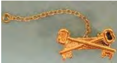
AUX-7031 Treasurer's Key Guard w/Chain $6.00