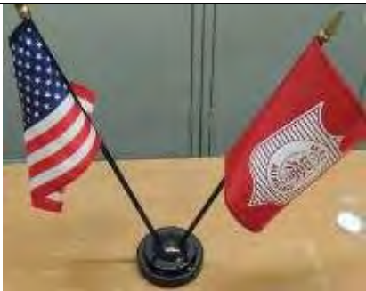
AUX-6000 Flag Set $10.00