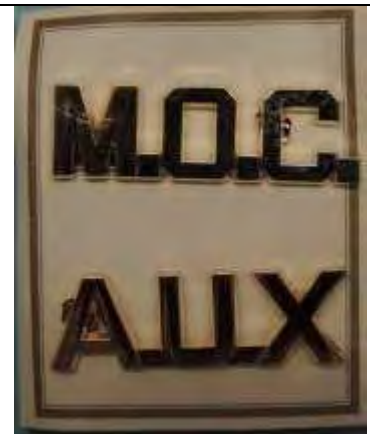
AUX-7020 Collar Pin (Gold) $12.00