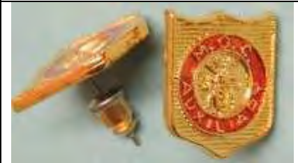
AUX-8005 MOCA Earrings - Post $5.00