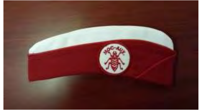
AUX-5003F "Female" AUX-5003M "Male" Grand President Hat $65.00 (Questions on Other Officer hats please contact Supreme Headquarters 412-824-2240. )