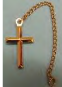
AUX-7041 Chaplain's Pin Guard (To be used with Membership Pin) $6.00